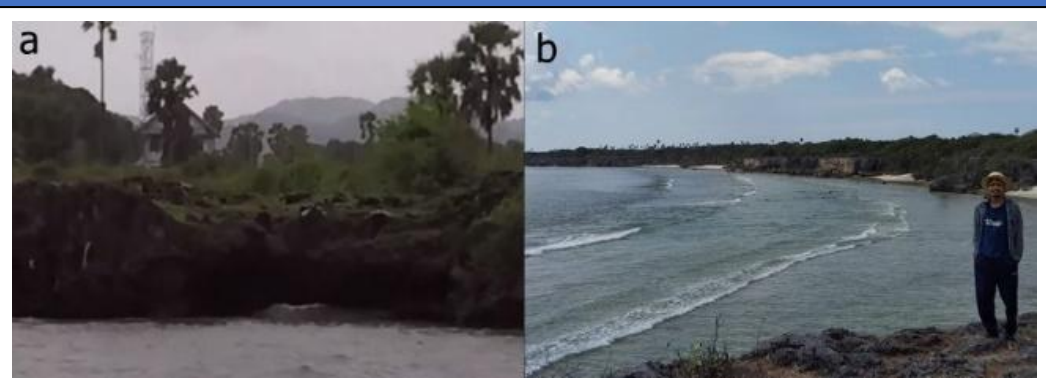
Figure 2. Sasi Area Boundaries (a) Tanjung Ayam, (b) Tanjung Garam

Based on the Regulation of the Minister of Maritime Affairs and Fisheries of the Republic of Indonesia Number 8 / Permen-Kp / 2018, concerning procedures for determining the management areas of indigenous peoples in the use of space in coastal areas and small islands, the Territory of Indigenous Peoples hereinafter referred to as Managed Areas is a water space whose marine resources are utilized by Indigenous Law Communities and become the area of the Customary Law Community (Mansur & Marzuki, 2018)