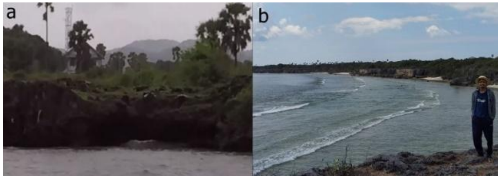
Figure 2. Sasi Area Boundaries (a) Tanjung Ayam, (b) Tanjung Garam

Based on the Regulation of the Minister of Maritime Affairs and Fisheries of the Republic of Indonesia Number 8 / Permen-Kp / 2018, concerning procedures for determining the management areas of indigenous peoples in the use of space in coastal areas and small islands, the Territory of Indigenous Peoples hereinafter referred to as Managed Areas is a water space whose marine resources are utilized by Indigenous Law Communities and become the area of the Customary Law Community (Mansur & Marzuki, 2018)