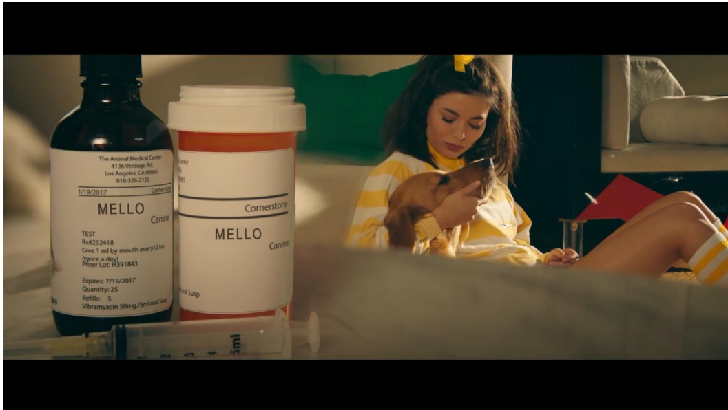
Figure 6. Focused image of medicine on the table and a worried girl holding her dog