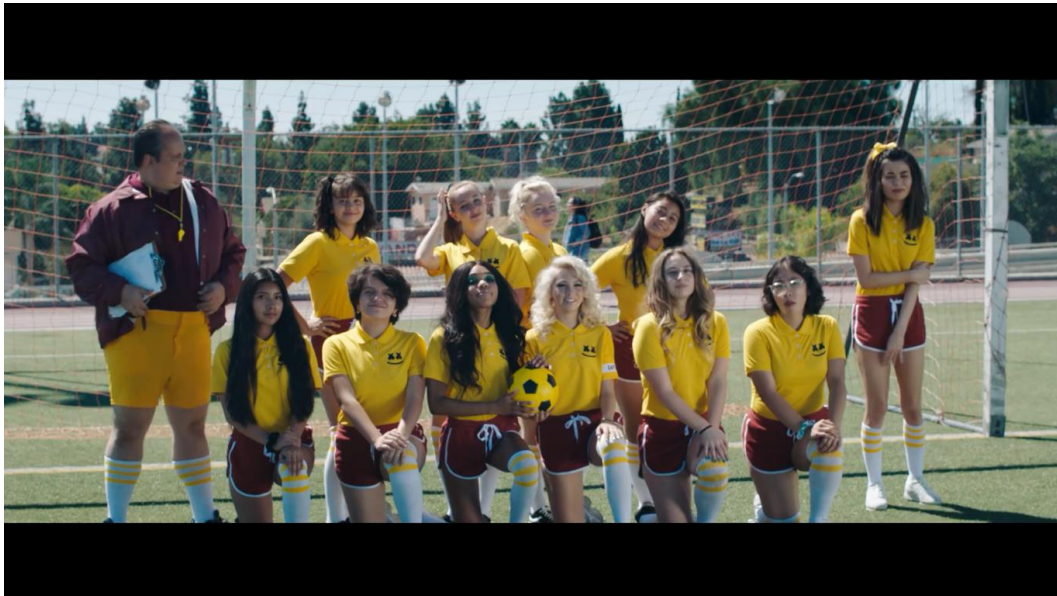
Figure 3. A group of people in position to take a group picture