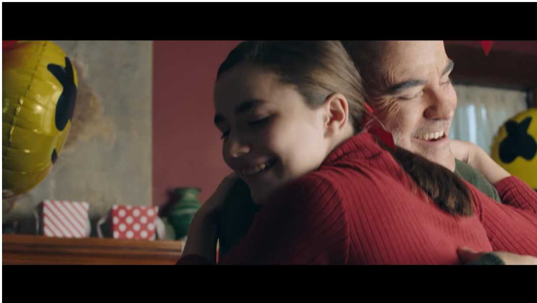
Figure 8. Two people hugging

The data was taken from Marshmello feat Bastille's music video entitled "Happier". The snapshot was taken from time stamp 03:13. In this snapshot there are non verbal elements that can be found. Below are table explaining the non verbal elements that can be found in this snapshot.