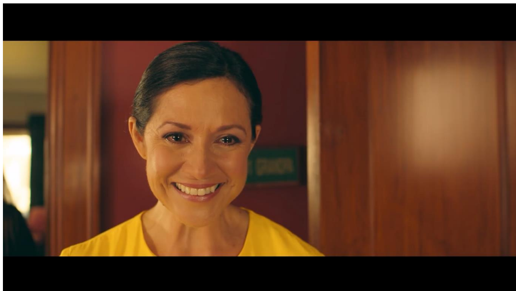
Figure 10. Smiling woman

The data was taken from Marshmello feat Bastille's music video entitled "Happier". The snapshot was taken from time stamp 03:37. In this snapshot there are non verbal elements that can be found. Below are table explaining the non verbal elements that can be found in this snapshot.