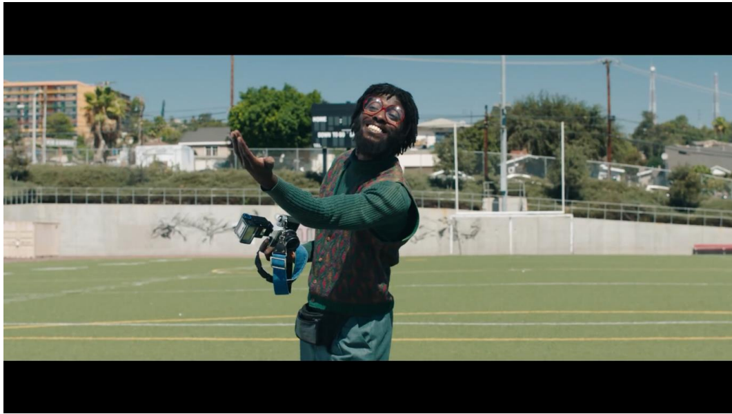
Figure 4. A man making a body movement that shows a friendly invitations to do something

The data was taken from Marshmello feat Bastille's music video entitled "Happier". The snapshot was taken from time stamp 01:31. In this snapshot there are non verbal elements that can be found. Below are table explaining the non verbal elements that can be found in this snapshot.