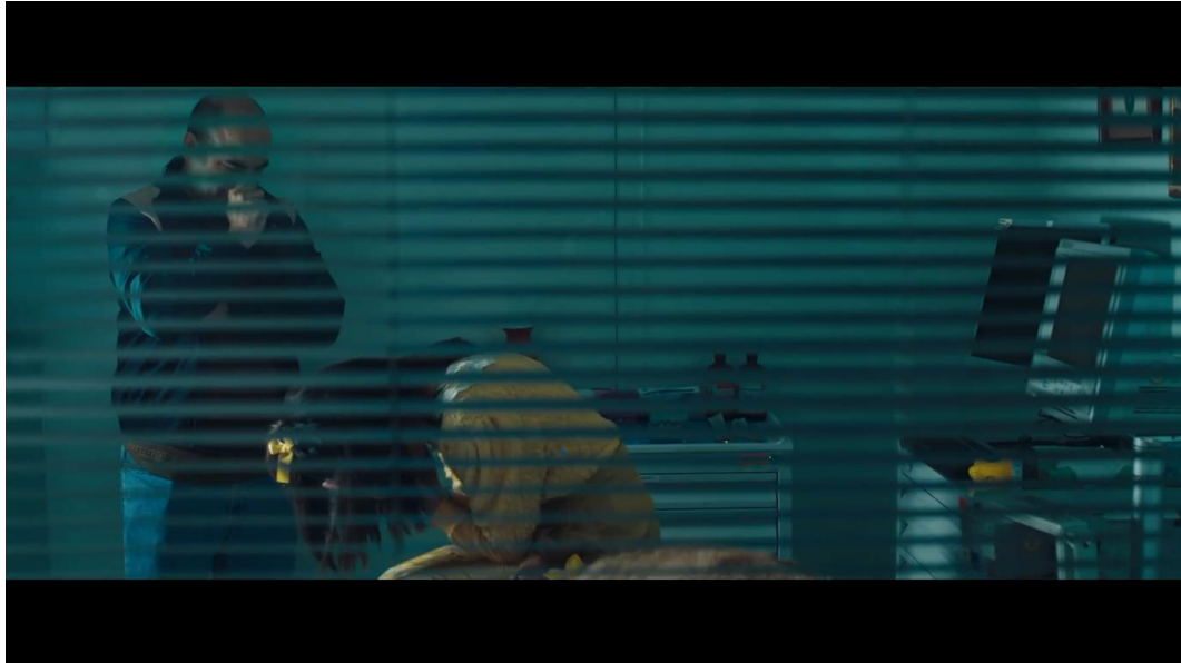
Figure 7. Two people looking down