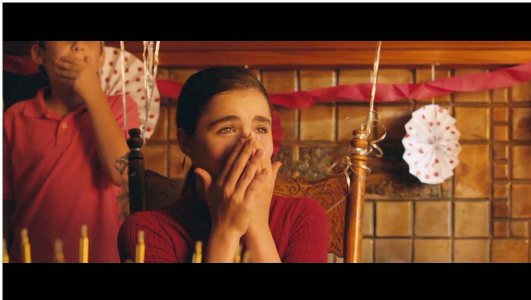
Figure 9. A girl expressed surprised expression

The data was taken from Marshmello feat Bastille's music video entitled "Happier". The snapshot was taken from time stamp 03:30. In this snapshot there are non verbal elements that can be found. Below are table explaining the non verbal elements that can be found in this snapshot.