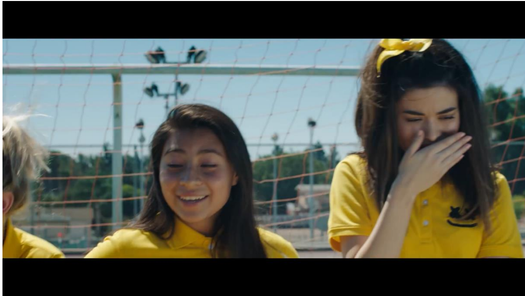
Figure 5. A girl hiding behind her hands

can be found. Below are table explaining the non verbal elements that can be found in this snapshot.