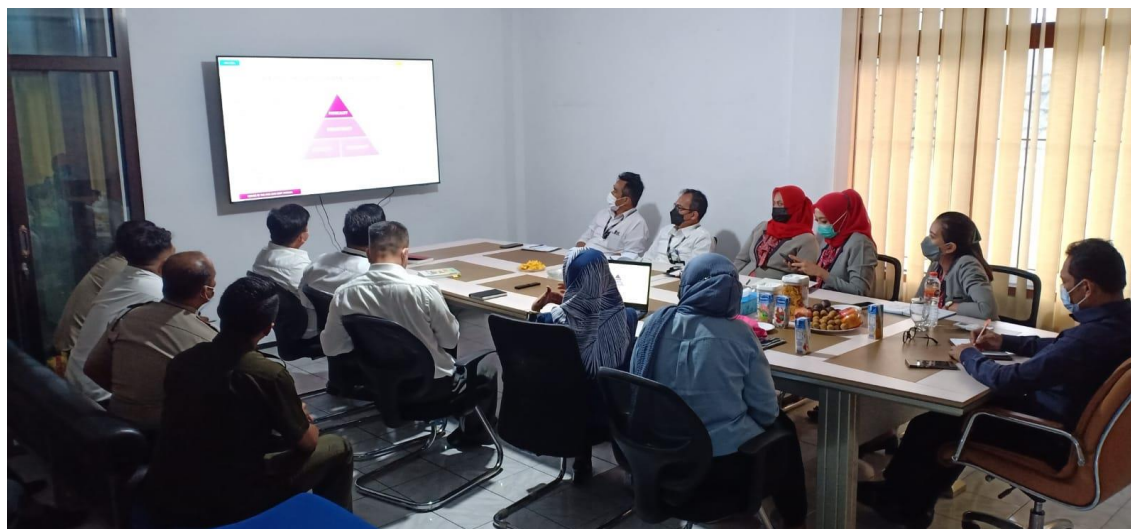
Figure 1. HR Management Training from Smart Indonesia Academy to Bank Sulutgo Malang

On February 21, 2022, Smart Indonesia Academy held a community service activity in the Bank Sulutgo Malang office, which was attended by the Bank Sulutgo Malang staff.