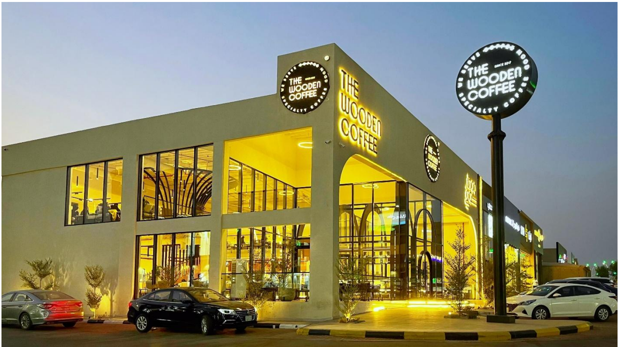
Figure 1. The Wooden Coffee, a prominent contemporary specialty coffee shop in Unaizah, offers a spacious environment for consumers to enjoy a "third place" experience beyond their homes and workplaces. It serves as a gathering spot for young individuals in Unaizah to connect and engage in meaningful conversations.

Understanding the influence of modern coffeeshops on the adoption of a contemporary lifestyle among the youth is essential for policymakers, community leaders, and coffeeshops owners. It enables them to cater to the evolving needs and aspirations of the youth, ensuring the sustainability and relevance of the coffeeshops culture in Unaizah. By providing spaces that encourage self-expression, social connections, and personal growth, modern coffeeshops can continue to play a vital role in shaping the city's youth culture and fostering a sense of belonging within the community (Micheletti et al. , 2012; Maspul, 2023).