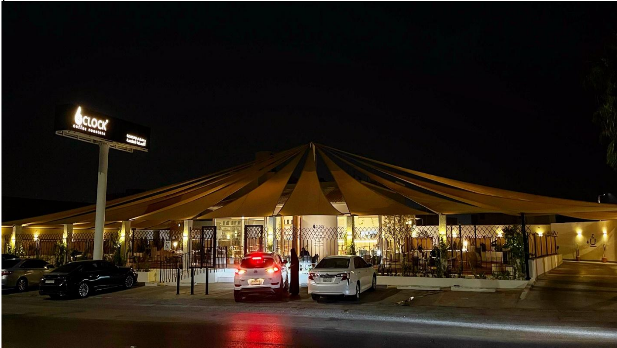
Figure 2: 6 O'Clock Coffee Roasters stands out as a pioneering contemporary specialty coffee shop, showcasing the essence of local wisdom as a distinctive flavor in the realm of fourth wave coffee culture. Its unique approach has made it a sought-after destination for young individuals from across the Al Qassim region to gather in Unaizah.