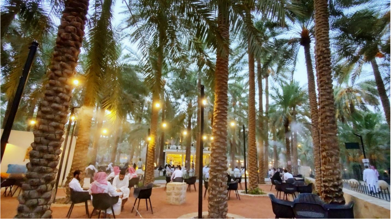
Figure 3: Jazla Coffee, Fay Coffee, and Rahab Coffee, located in phase 1 of the Jaaddat Alnakhil project in Unaizah, embody the essence of coffee as a social and cultural heritage. These establishments promote the intertwining of local wisdom, rooted in ancient traditions of dates farming and coffee culture, creating a unique experience that showcases the rich cultural heritage of Unaizah.

clientele and adopt a more upscale ambiance, there is a concern that the traditional egalitarian spirit is being compromised.